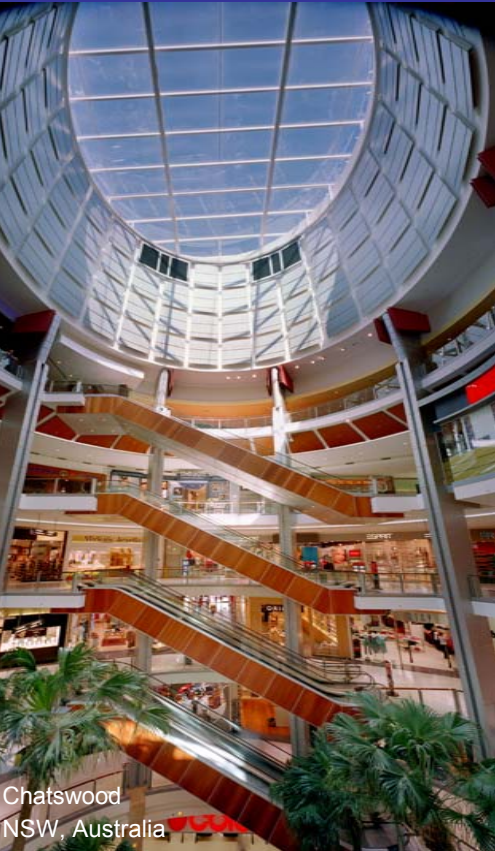
Chatswood NSW, Australia