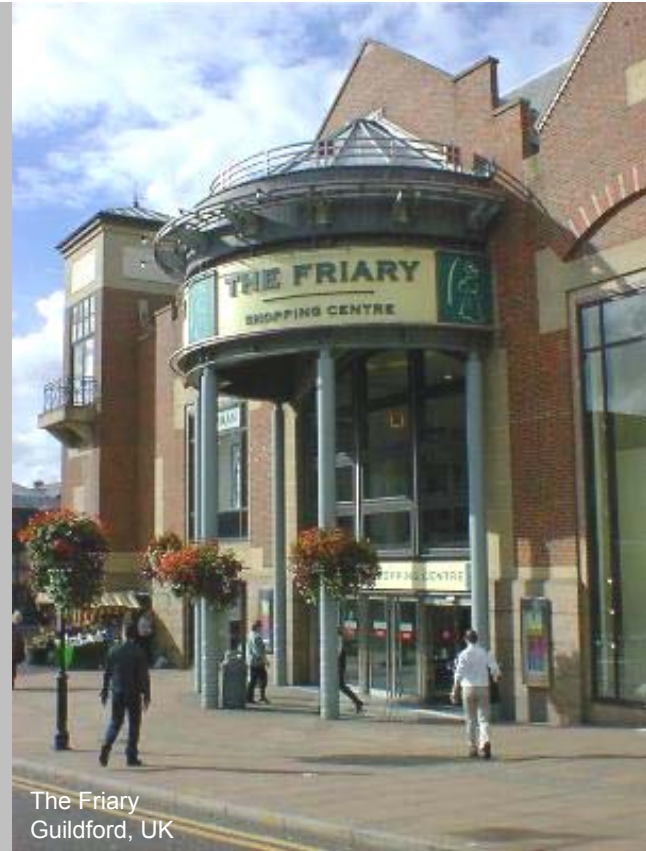
The Friary Guildford, UK