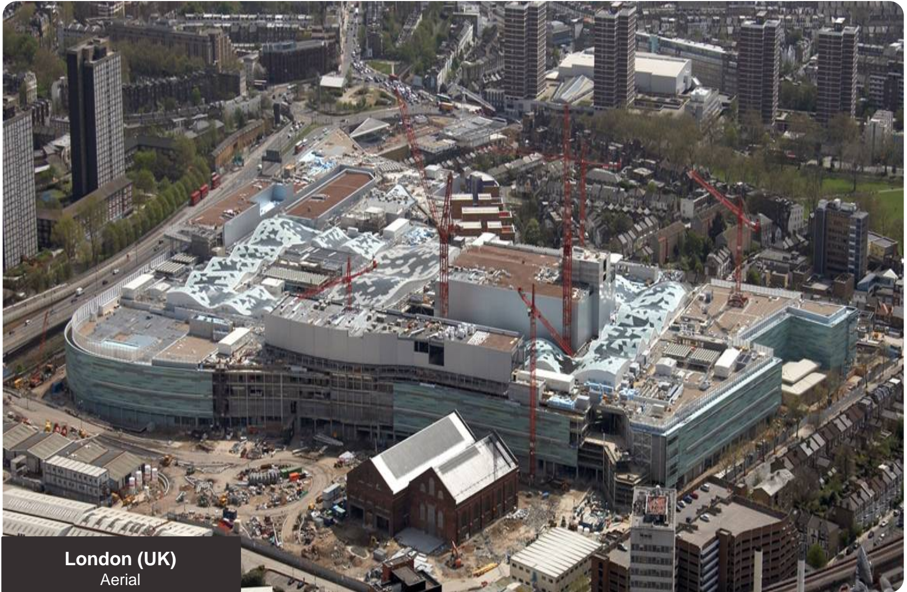
London (UK) Aerial