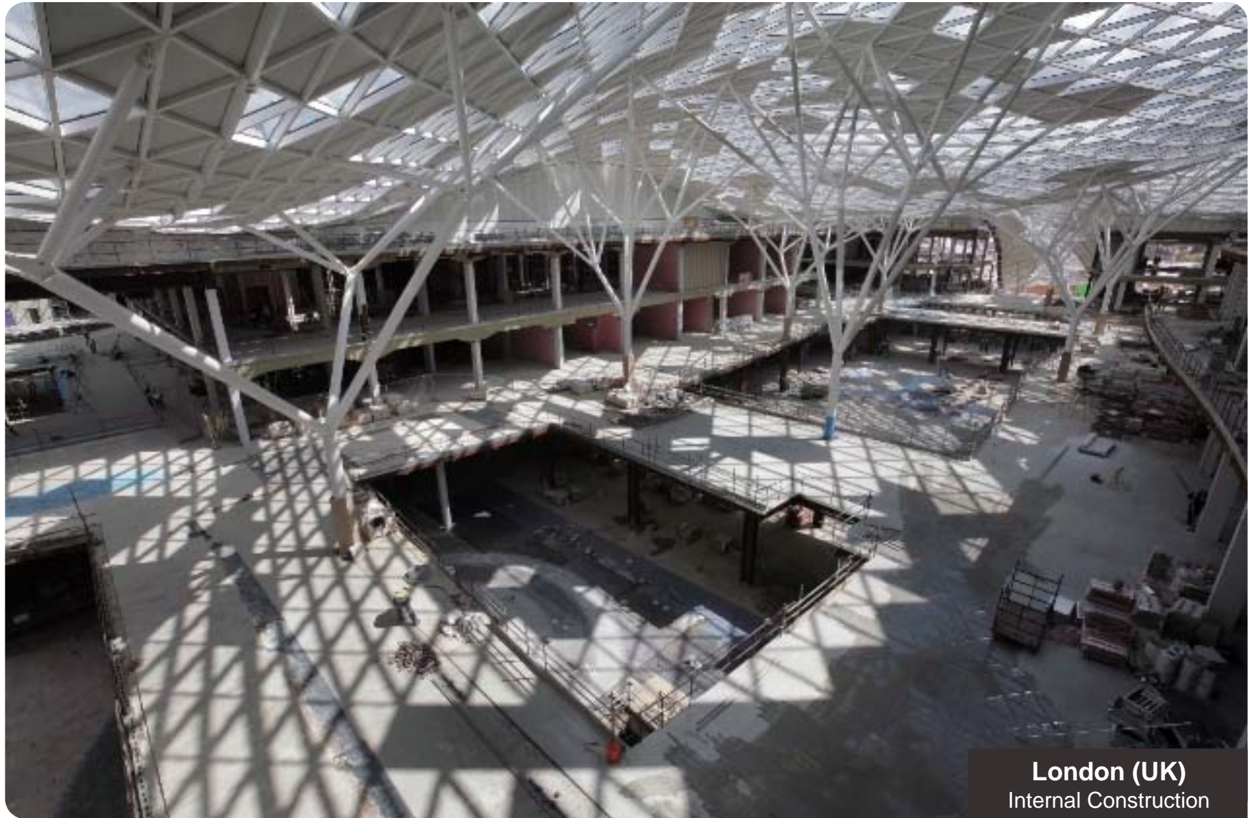
London (UK) Internal Construction